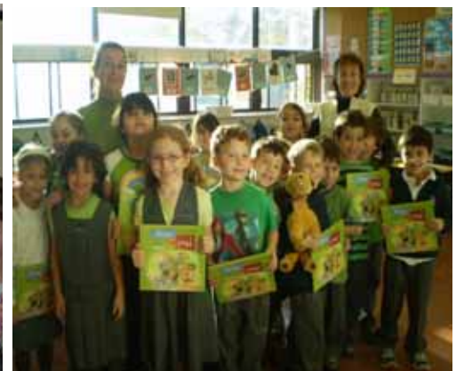
JPPS Kids Rock!