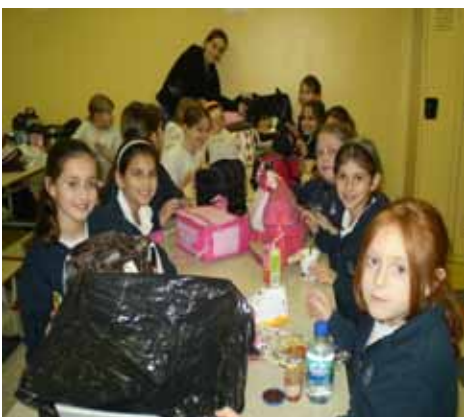
Look Ma, No Garbage!

A large proportion of grade 6 students said that the school going green “didn’t accomplish anything” and that “the only thing accomplished was getting kids to lose their spoons” That’s why we must persevere and go further than that and maybe one day have a completely waste free school.